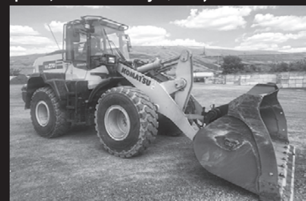
'22 Komatsu WA270-8 ldr. , 3200 hrs., 4 spd. hydrostatic, JRB coupler, 3rd valve, includes 3.5 cu. yd. bucket, ldr. scales, CB, stereo, back up camera, all the bells & whistles! $185,000.