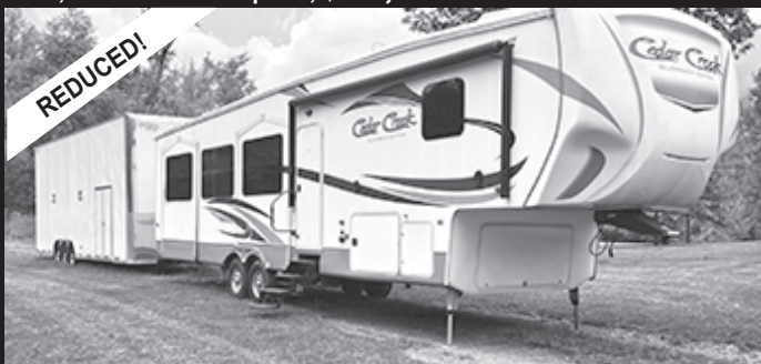
'17 Cedar Creek 37RL 5th whl. , (5) slides, all the bells & whistles, king bed, washer & dryer, lots of storage, big kitchen - too much to list!! $42,000 $40,000 or best offer.