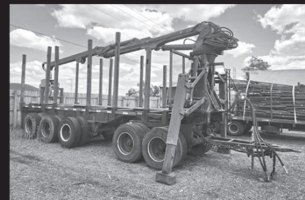
'83 O'Brien 25' 5-axle log pup , (1) lift axle, Hawk 1200 self-loading log crane w/brand new Serco continuous rotation grapple, 3-line wet kit, $20,000 or best offer.