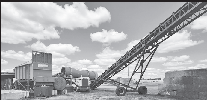
'08 Color Trom 250 by Amerimulch Co. , 2nd owner, complete color plant, 25-yd. hopper, 85' radial stacker, paint mixer & scales, 250 yds. per hour, by far the best coloring system I have ever used!! $125,000.