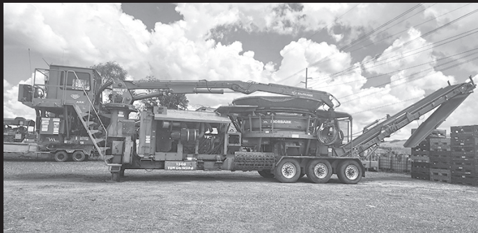
'14 Morbark 1300B tub grinder , 2nd owner, 8700 hrs., Cat 3412, 1050 hp, hydraulic PT Tech clutch, 400 Morlift self-loading grapple, heat, A/C, stereo, CB, autofeed, remote control, reversing fan, extra screens & parts, $475,000.