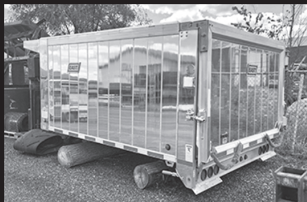
New East Genesis 2 , 11.5'x102"x60", 3-way air gate, pre-wired for tarp, tail lights, marker lights, strobe lights already installed, $20,000.