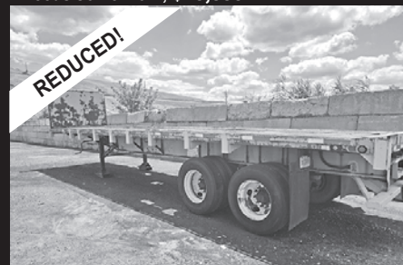
'07 Fontaine 36.5' flatbed trlr. , tdm. axle, 22.5 hub pilot, tool box, sliding strap winches, steel bulkhead, log posts avail., $10,000 $9,500 or best offer.