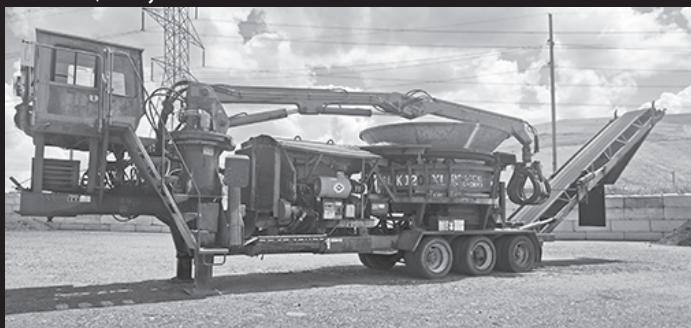
'02 Morbark 1200XL tub grinder , 11,200 hrs., Cum. QSK-19, 750 hp, new mill & mill bearings, new belt, 350 Morlift self-loading grapple, heat, A/C, CB, autofeed, reversing fan, all extra screens & parts, clean turn-key! $225,000.