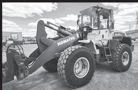
'08 Komatsu WA250PZ-6 ldr. , 14,600 hrs., 4 spd. hydrostatic, JRB coupler, includes 3.5 cu. yd. bucket, 3rd valve, A/C, CB, stereo, any extra parts, $62,000.