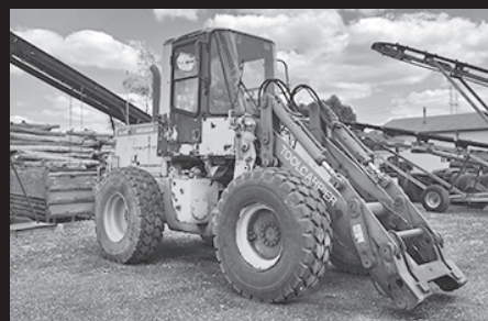
'00 Komatsu WA1803PT , 20,000 hrs., Cum. 5.9, 4 spd. torque shift, JRB coupler, includes 2.5 cu. yd. bucket, loader scales, good tires, center pins tight, runs & operates, rusty and needs some work, $10,000.